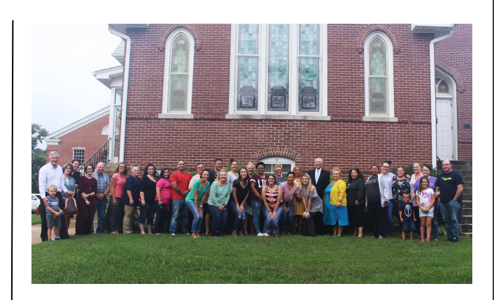
The 22<sup>nd</sup> District Recovery Court at their monthly Family Fellowship Meal hosted by 1<sup>st</sup> United Methodist Church of Lawrenceburg, who has partnered with other local churches to prepare and serve a meal prior to our team meeting and status hearing.

Dekalb County had a needs assessment for their community and invited all of our churches to see how they could help the needs with those in active addiction and recovery. They explained of how the churches can be certified through the state and what resources the state could help our churches with. Also just a good informative meeting where they spoke about the stats in our state and county but how to break the stigma surrounding those in addiction