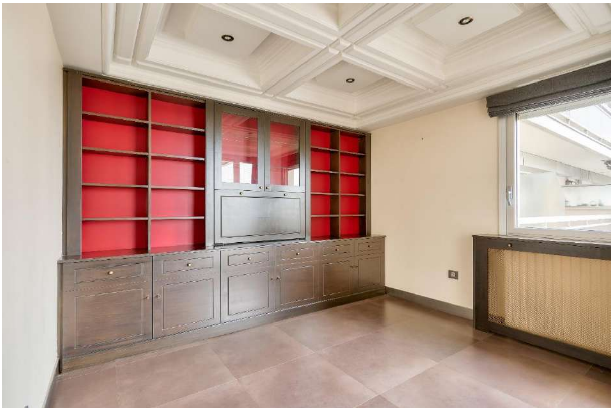
2nd office of the Master bedroom

Contact : Shahine Ismail, L'Arbre de Vie shahine.ismail@larbre-de-vie.net +(33) 6 15 23 94 98 larbre-devie.com