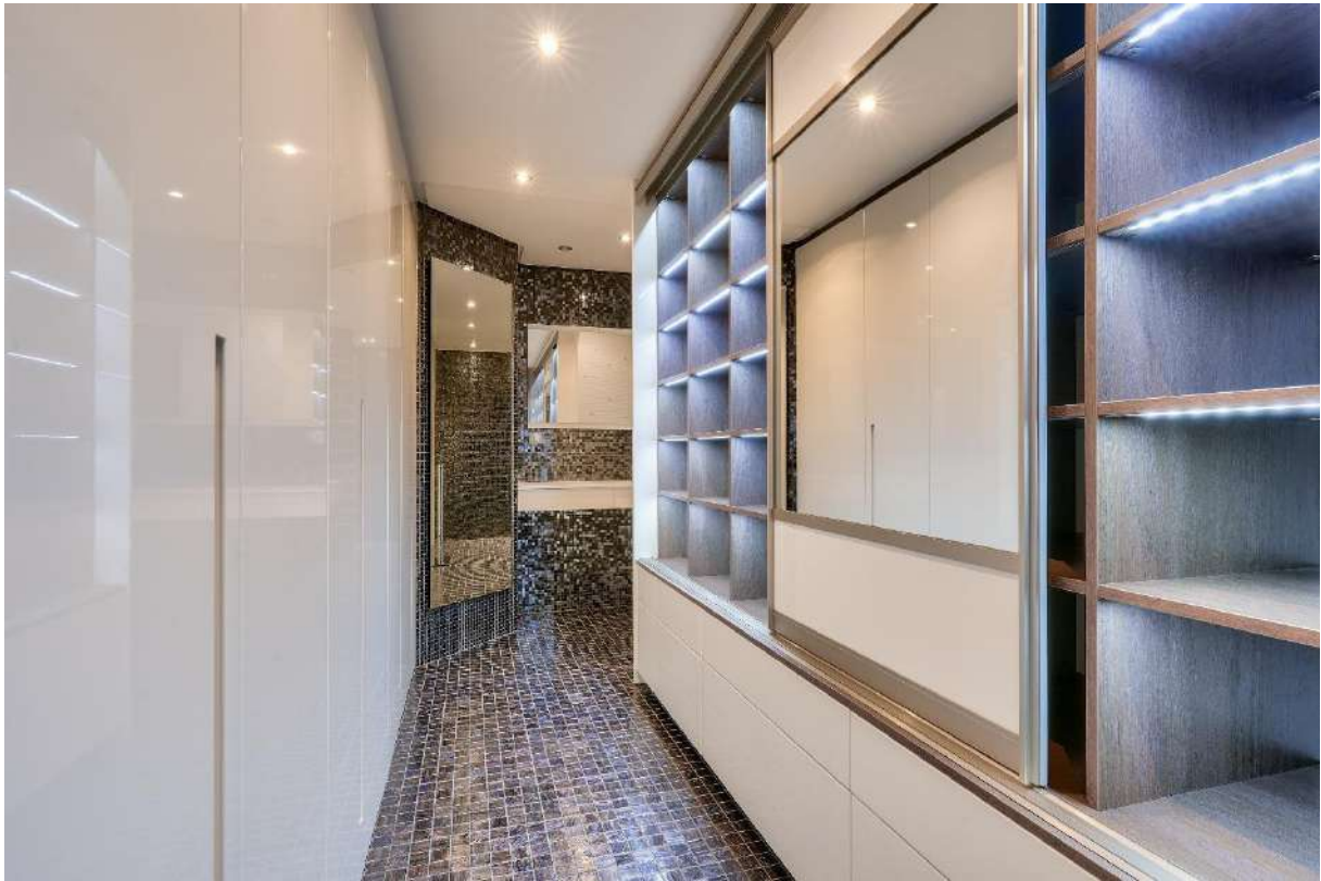
Large dressing room in the master bedroom

Bright and renovated 187 sq.m apartment opening on 2 balcony terraces of 18 sq.m and 9 sq.m Neuilly sur Seine, close to the Bois de Boulogne, transports and shops