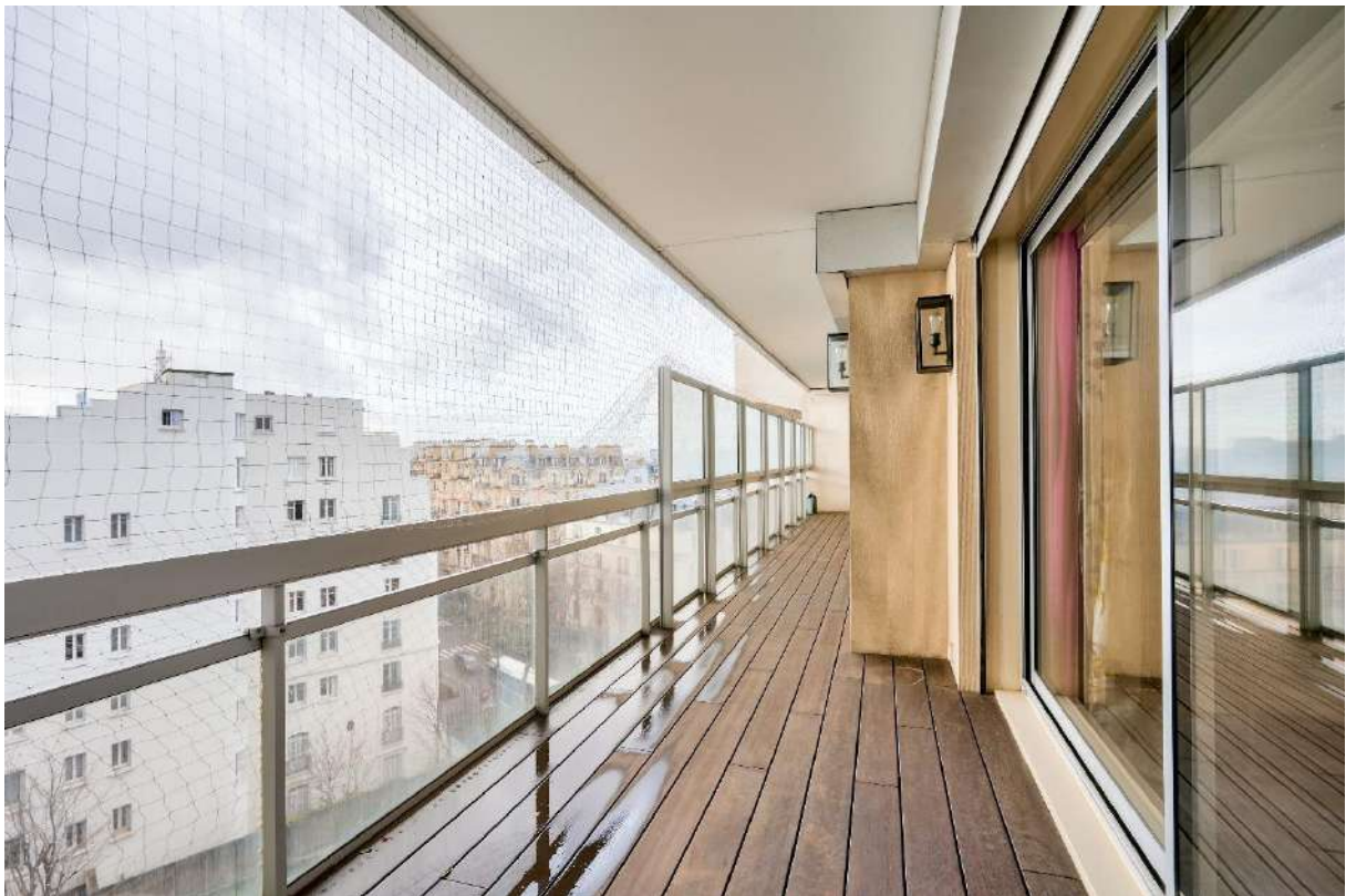
Terrace of the Master bedroom

Contact : Shahine Ismail, L'Arbre de Vie shahine.ismail@larbre-de-vie.net +(33) 6 15 23 94 98 larbre-devie.com