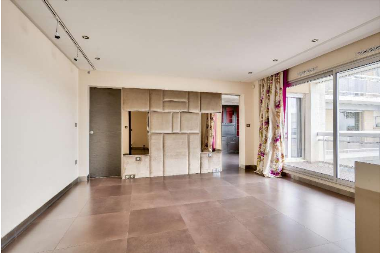
Master bedroom and shower room

Bright and renovated 187 sq.m apartment opening on 2 balcony terraces of 18 sq.m and 9 sq.m Neuilly sur Seine, close to the Bois de Boulogne, transports and shops