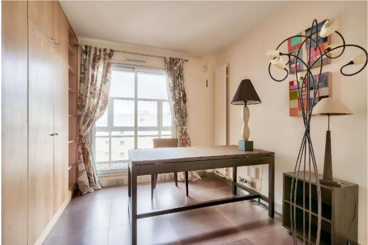
Master bedroom office and dressing room

Bright and renovated 187 sq.m apartment opening on 2 balcony terraces of 18 sq.m and 9 sq.m Neuilly sur Seine, close to the Bois de Boulogne, transports and shops