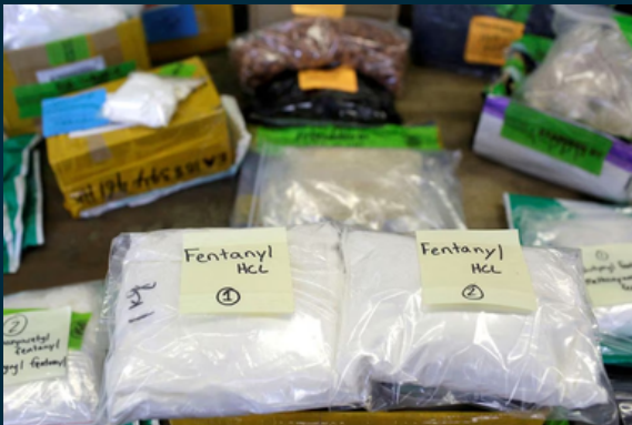
PLASTIC BAGS OF FENTANYL ARE DISPLAYED ON A TABLE AT THE U.S. CUSTOMS AND BORDER PROTECTION AREA AT THE INTERNATIONAL MAIL FACILITY AT O'HARE INTERNATIONAL AIRPORT IN CHICAGO, ILLINOIS, U.S. NOVEMBER 29, 2017.

Check their website or sign up for their newsletter to see offerings