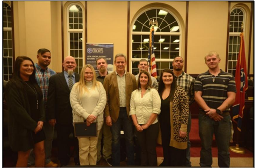
Governor Bill Lee with graduates of the ceremony for which he served as keynote speaker