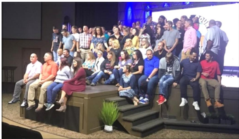
Recovery Court participants at graduation.

The eight modules on life skills include communication, financial, social, physical health, nutrition, personal appearance, the job interview, and the resume. The weekly group schedule is Monday 6:00 p.m. to 8:00 p.m., Tuesday 8:30 a.m. to 10:30 a.m., Wednesday 9:30 a.m. to 1:30 p.m., Thursday 6:00 p.m. to 8:00 p.m. The Blount County Public Library is located at 508 N. Cusick Street, Maryville, TN. For more information, go to Life Skills