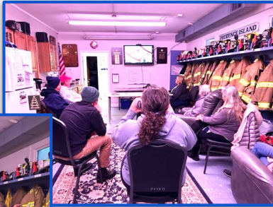
First Aid Training

In January Fire Department Members attended training sessions in Modern Fire Behavior, First Aid Refresher, Scene Size Up and EMS Report Writing.