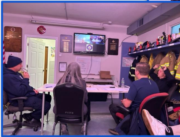
Report Writing/DH Reports